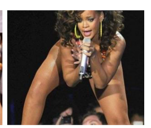
Embarrassing Pics You Don't Want to Miss